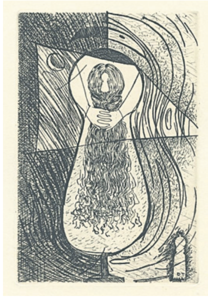
Plate from 'Le Surréalisme en 1947', etching